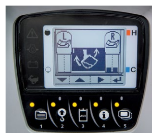
Max. Oil Flow Setting