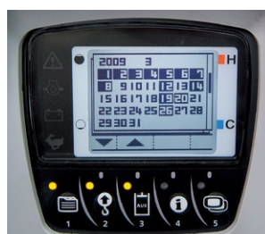
Operation History Record